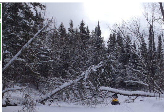
A snowmobiler on the Rat Root River driving under a log jam.