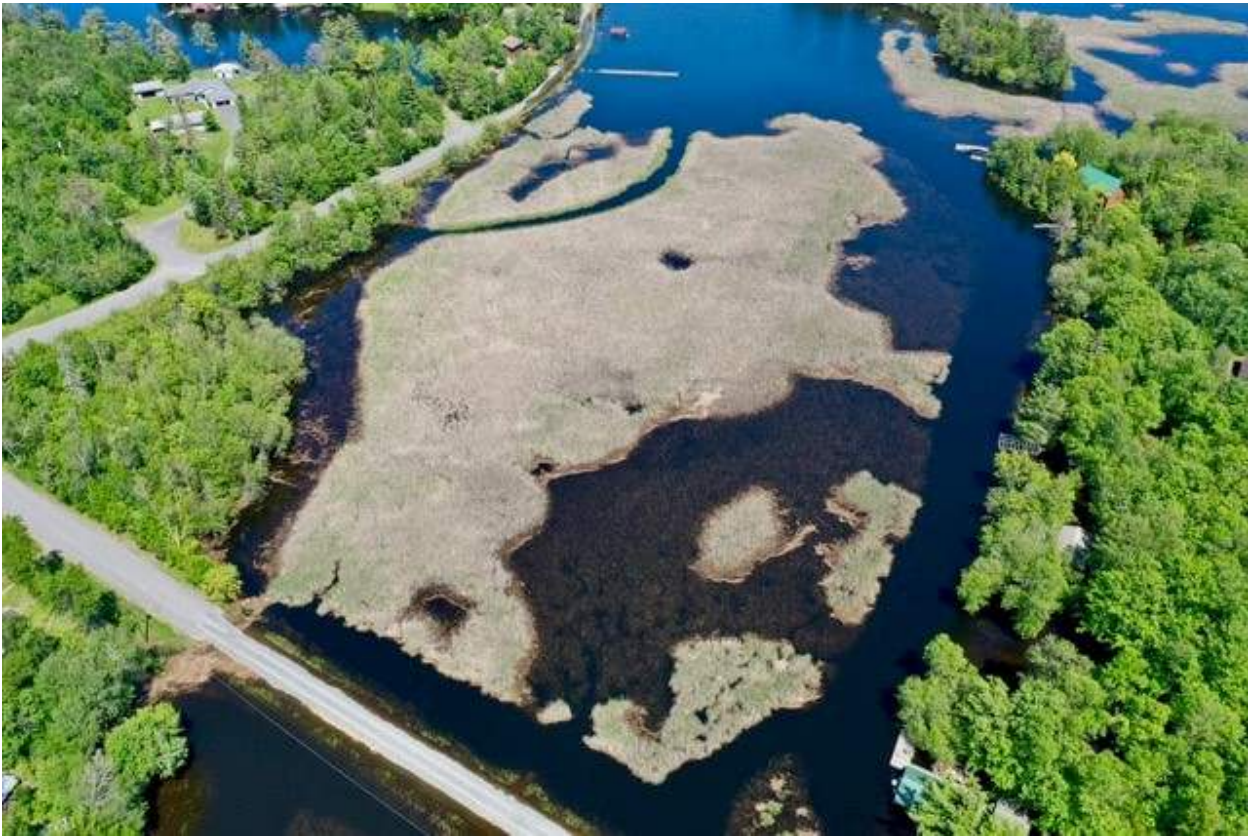
After Cattail Removal: June 7, 2024 Picture (prior to road work/new culvert)