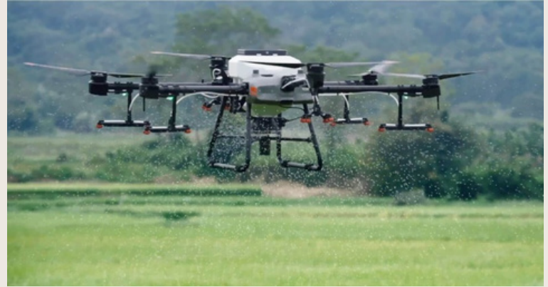
The DJI AGRAS T30 Agriculture Crop Protection Drone

We are excited to announce the addition of an agricultural drone to our conservation toolbox! Our drone has the capacity to carry 7 gallons of herbicide or 50 pounds of seed at a time. It is ideal for smaller fields but also has the ability to tackle larger fields. We are able to seed anything from small native seeds to larger cover crop seeds. This will help to reduce the compaction and rutting issues of conventional equipment, especially in those low spots of your field. The landowner will provide the seed mix and we'll take care of the rest! We have also completed the permitting process to spray herbicide. The staff can help with herbicide selection and purchase the herbicide if needed. If the landowner supplies the herbicide, it must have been purchased in last two years and herbicide information must be shared with KSWCD staff prior to application.