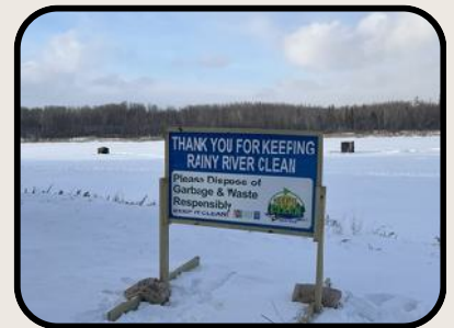
Pictured: Rest stations and educational signage on Rainy Lake and Rainy River.