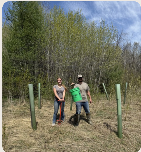
Koochiching SWCD staff install tree tubes.