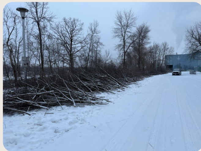
Buckthorn cut and ready to be chipped by the City of International Falls.

In addition to CWMA coordination, the Soil & Water Conservation District (SWCD) also manages a cost-share program available to