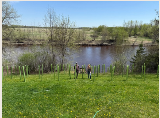
Koochiching SWCD installing tree tubes for a local landowner.