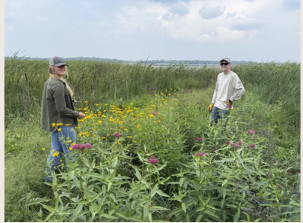
Koochiching SWCD staff stand by a pollinator planting installed summer 2025.

Even if you're not sure about what project would work best, if you have natural resource concerns or objectives that you would like to achieve on your property, contact us and we can help you develop your ideas into a full-fledged project from design and mapping to contracting and installation.